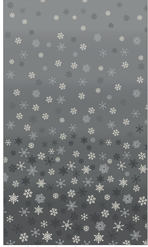
*2248/S Snowflake Ombre Double Border Actual size of image shown 12" x 22" (30 x 56ms)