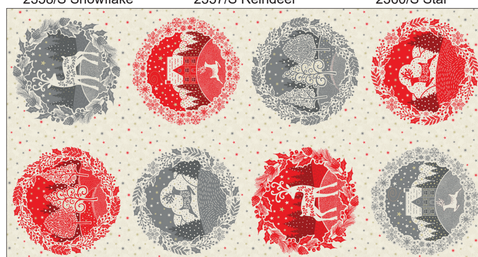
2361/1 Scandi Circle Panel Actual size of image shown 24" x 44" (60 x 112cms)