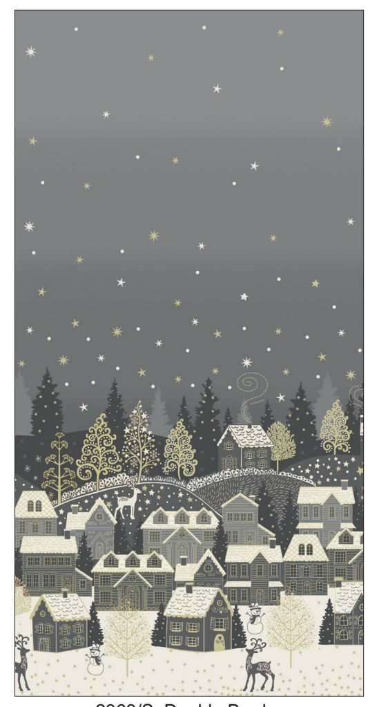
2363/S Double Border Actual size of image shown 12" x 22" (30 x 56ms)